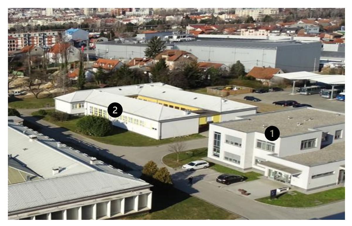
Figure 4. Photo of the Isolation unit (1) and Diagnostic imaging unit (2).

The separate building for Isolation unit was constructed with capacity for companion animal, farm animals and equine patient's hospitalisation. For companion animals the three consulting rooms are available, as well as four rooms for hospitalisation. Farm animal and equine part is equipped with one consulting room and 4 premises for hospitalisation.