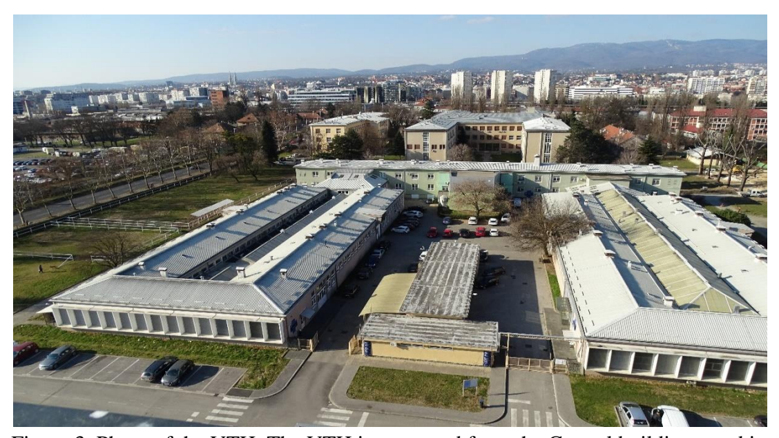
Figure 3. Photo of the VTH. The VTH is separated from the Central buildings, and it is located on the south part of the campus.