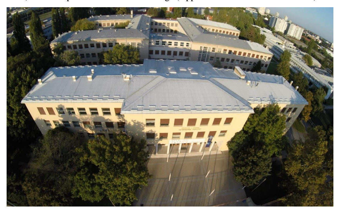
Figure 2. Photo of central buildings where Dean's Office, Administration, Teaching premises, Units, Laboratories, FL and the Archive are located.

The entire FVMUZ campus is located at Heinzelova Street 55 (Appendix 4.1.) in the Zagreb city centre. The campus is easily accessible for students, staff and clients, having good connection to major roads and public transport networks. As an integrated campus, FVMUZ owns 58 783 m<sup>2</sup> of land, while the total area of facilities is 26 915 m<sup>2</sup> (including all levels: ground floor, first and second floor). The campus consists of 12 buildings (Appendix 4.2. Plan of the FVMUZ).